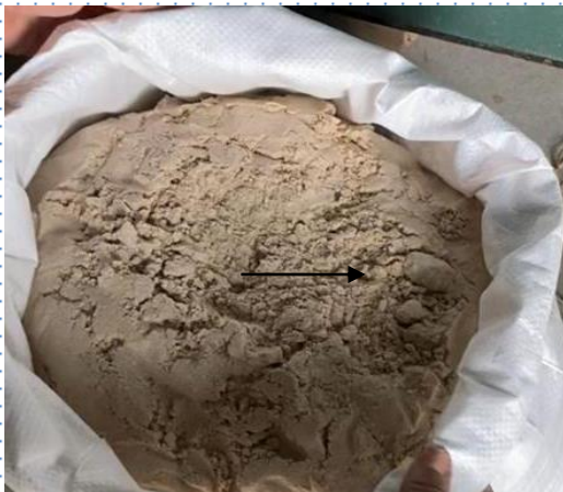
Zero Liquid Discharge Residue generated from Grasim

CSIR-AMPRI, Bhopal explored the possibility of utilizing zero liquid discharge residue for making wall panels and successfully developed a composite cladding panels/wall tiles. Realization of this findings and further advanced research in this area is expected to results a new class of architectural panels/ wall tiles and effective utilization and safe management of ZLDR leading to create a new business.