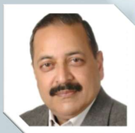
Dr. Jitendra Singh Hon'ble Minister (S&T) Vice-President, CSIR