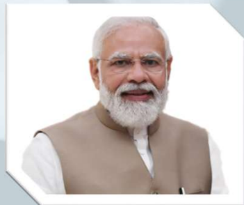
Shri Narendra Modi Hon'ble PM of India President, CSIR