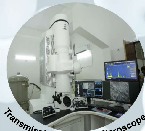
Transmission Electron Microscope