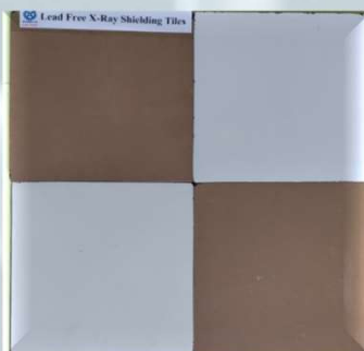
Lead Free X-ray Shielding Tiles