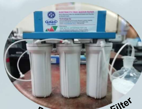
Domestic Water Filter

“Science knows no country, because knowledge belongs to humanity, and is the torch which illuminates the world” - Louis Pasteur