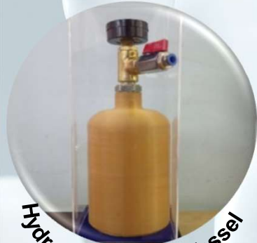
Hydrogen Storage Vessel