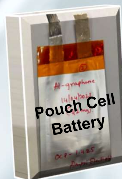
Al-graphene (14/4/2023) Pouch Cell Battery OCV-1.425 Arun-D-10/23